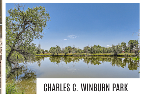
CHARLES C. WINBURN PARK

EXECUTIVE OFFICE CONDO FOR SALE IDEAL FOR SMALL BUSINESSES!