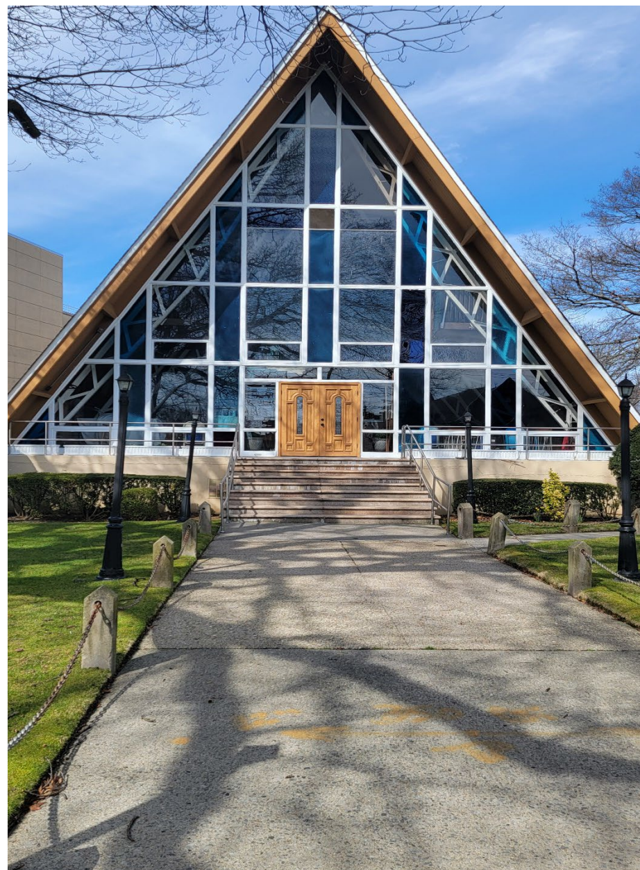
St. Albans Church Across Street