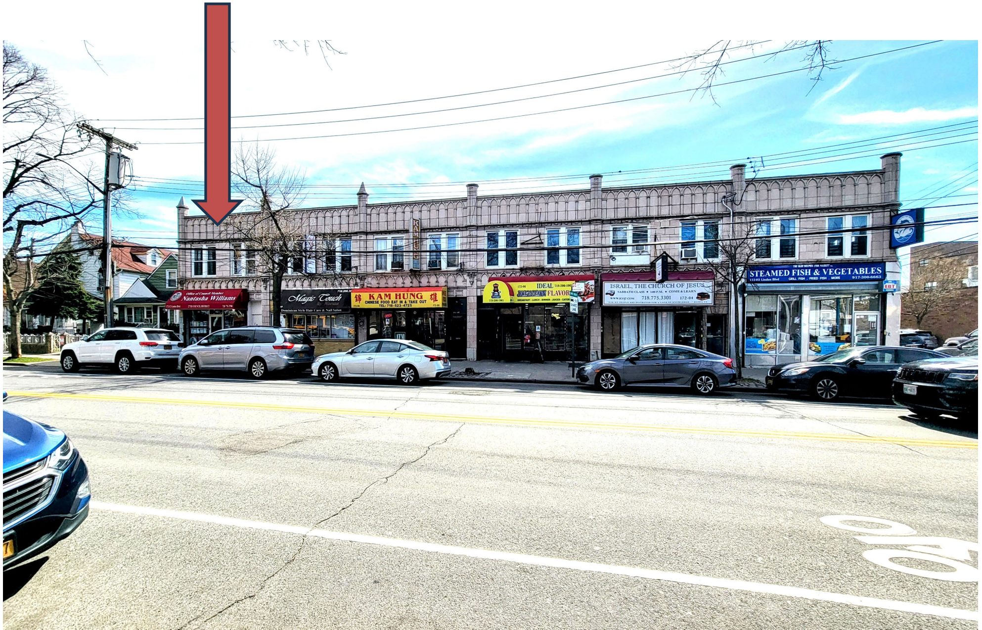
172-12 Linden Blvd. – Subject Part of Very Prosperous Retail Center.