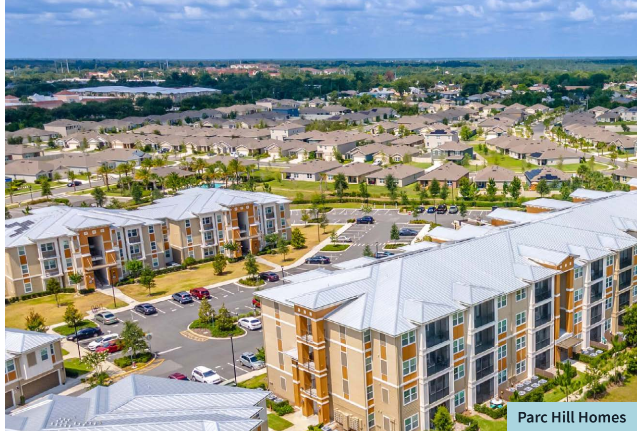
Parc Hill Homes

Traits: Maintain community connections across generations and demonstrate a preference for trusted and domestic brands.