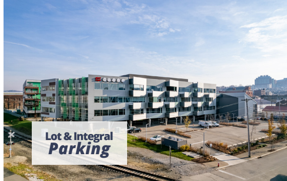
Lot & Integral Parking