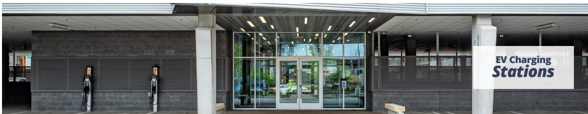
EV Charging Stations