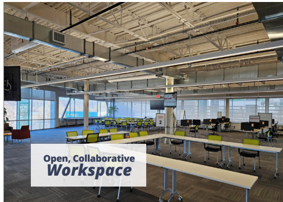
Open, Collaborative Workspace