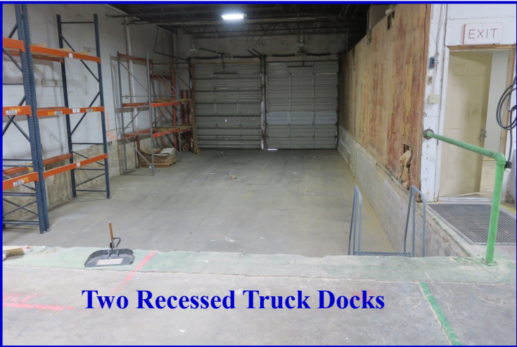
Two Recessed Truck Docks