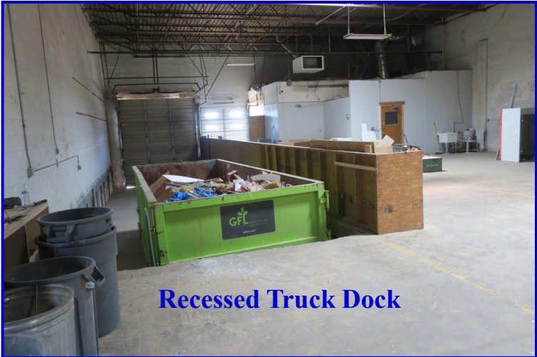
Recessed Truck Dock