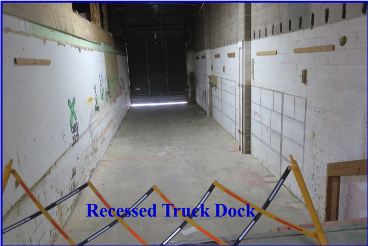
Recessed Truck Dock