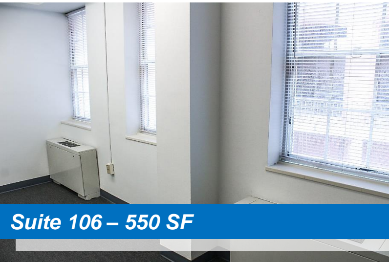
Suite 106 – 550 SF