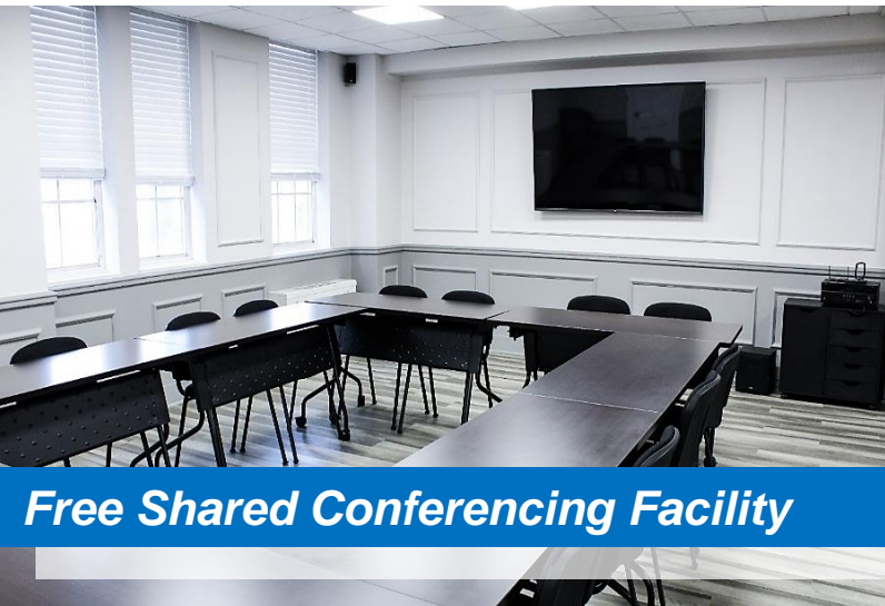
Free Shared Conferencing Facility