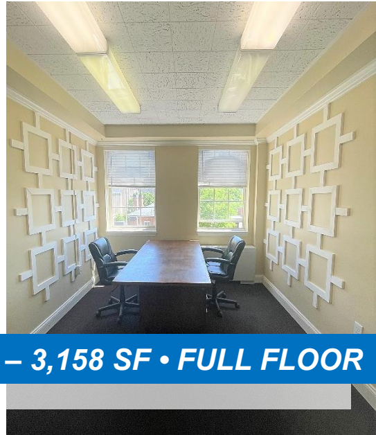
Suite 600 – 3,158 SF • FULL FLOOR