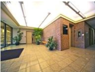
Lobby – Building E