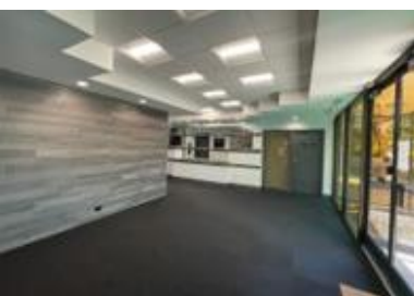
Lobby – Building C