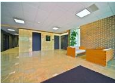
Lobby – Building A