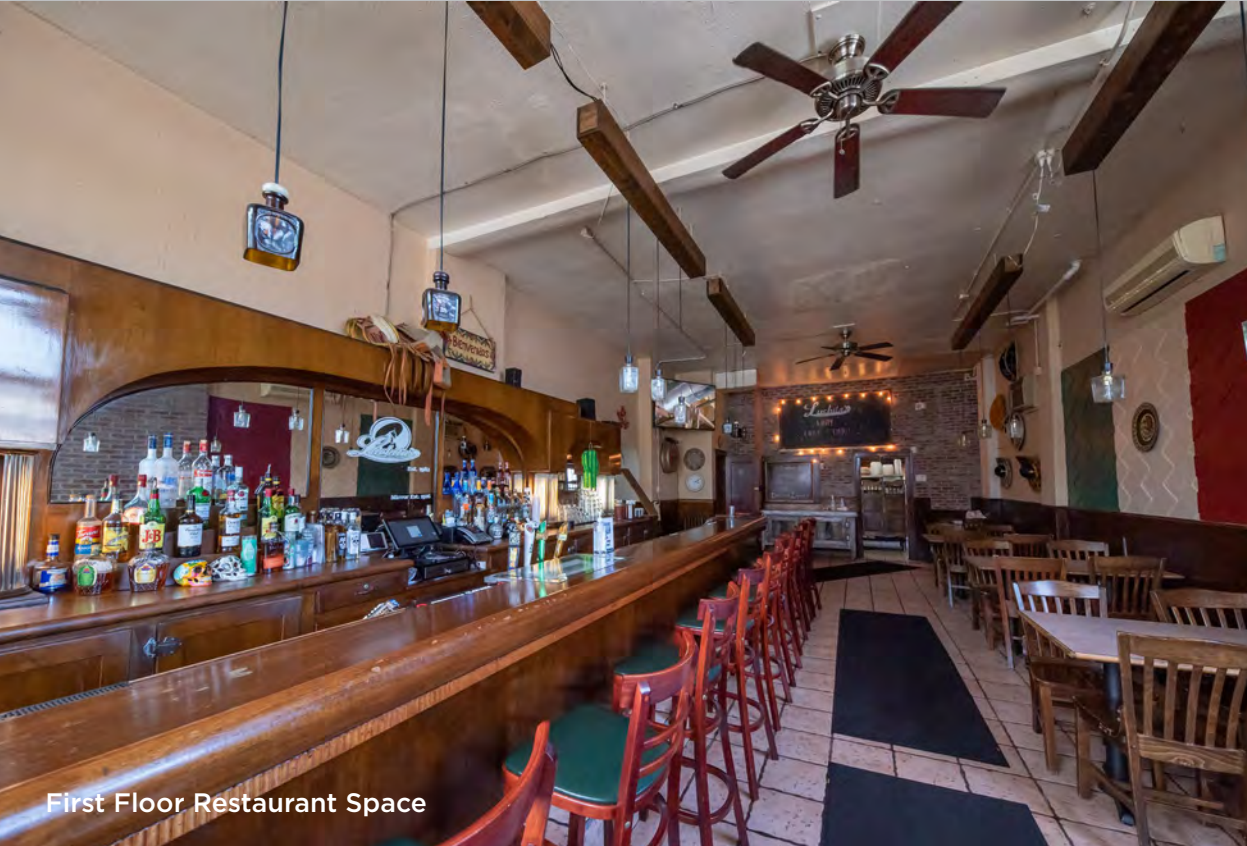
First Floor Restaurant Space