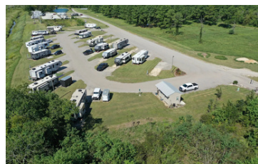
SECTION 1 & ENTRANCE

Well-positioned investment opportunity located in Harris County, TX. 50 existing RV sites, with room for future growth.