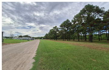
10 ACRES TO THE NORTH