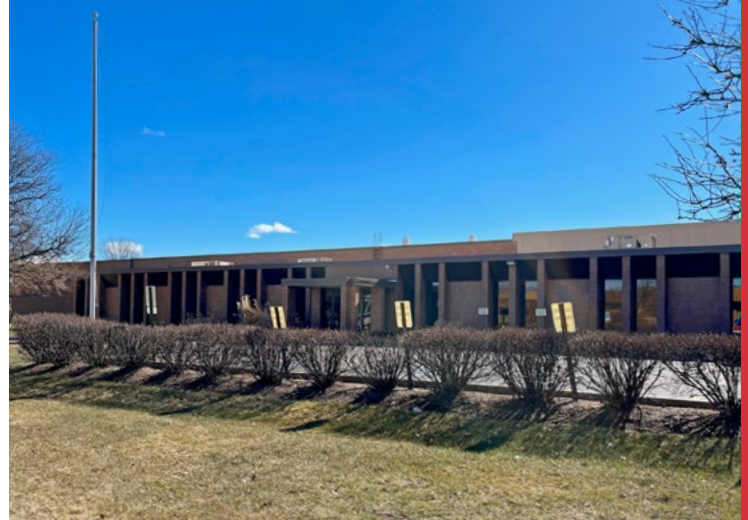
Pictured: Exterior Front