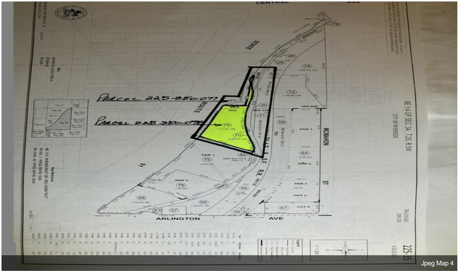
Jpeg Map 4