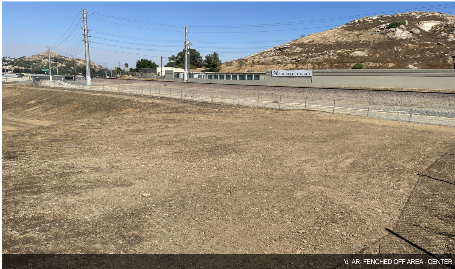
'd' AR- FENCED OFF AREA - CENTER