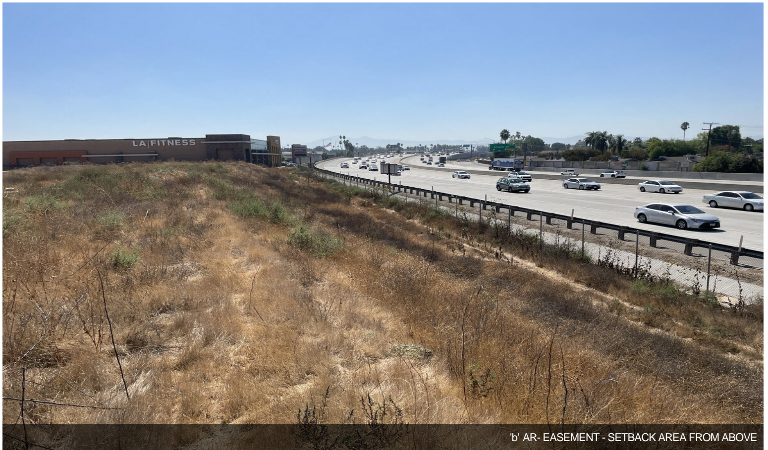
b' AR- EASEMENT - SETBACK AREA FROM ABOVE