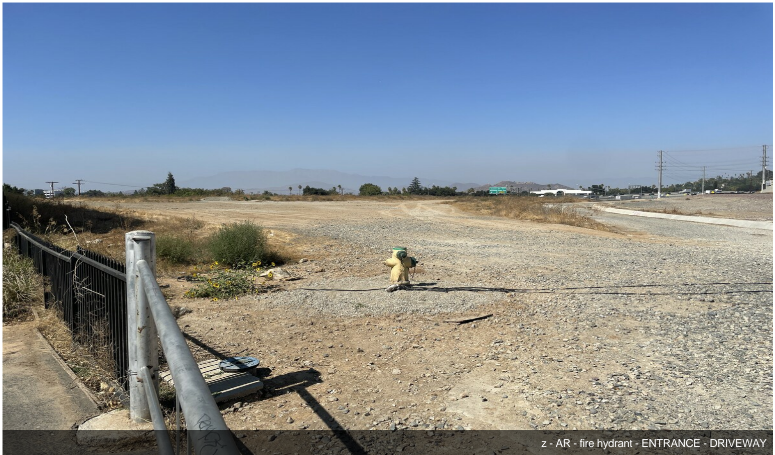
z - AR - fire hydrant - ENTRANCE - DRIVEWAY