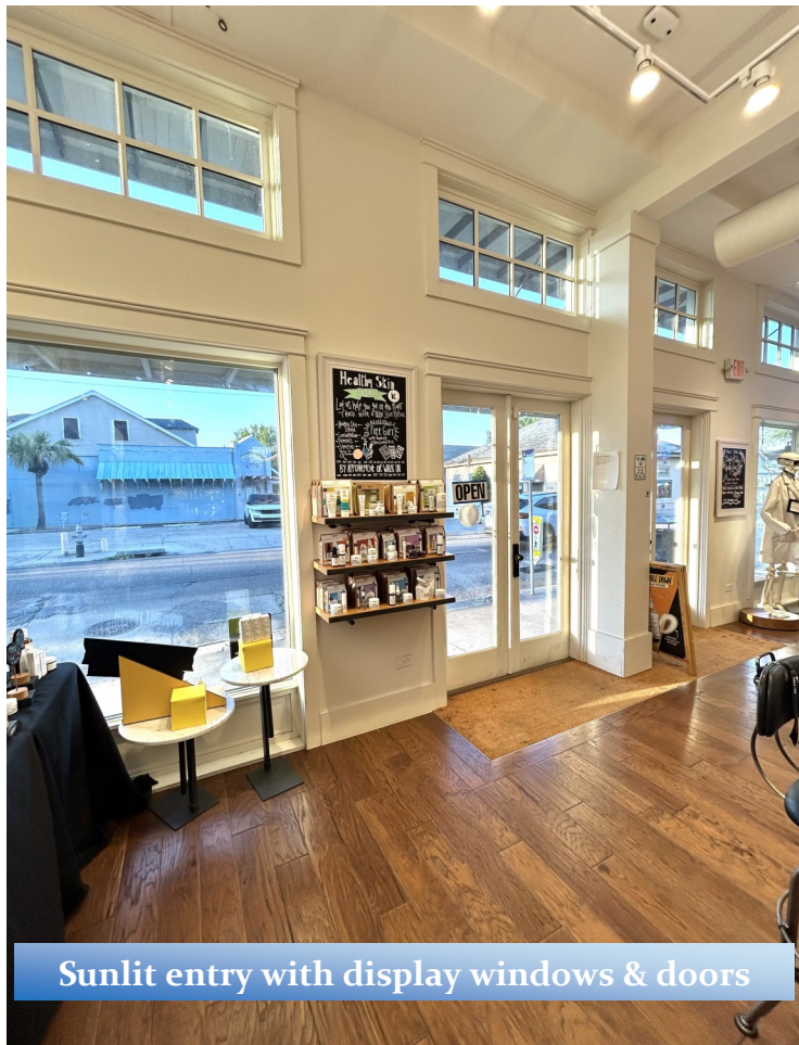
Sunlit entry with display windows & doors