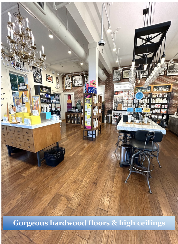
Gorgeous hardwood floors & high ceilings