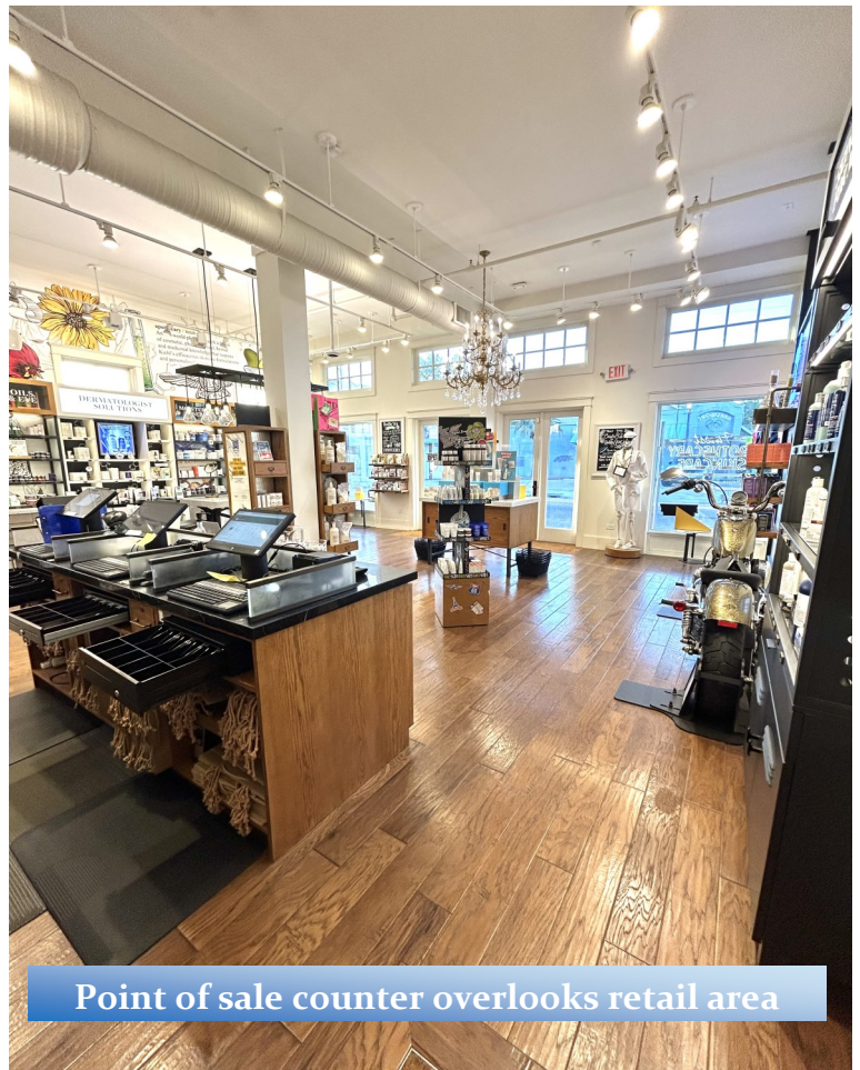
Point of sale counter overlooks retail area