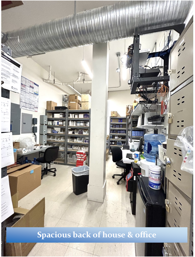
Spacious back of house & office