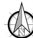
FLOOR PLAN SCALE: 3/16" = 1'-0"