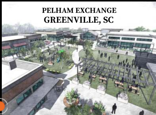
PELHAM EXCHANGE GREENVILLE, SC