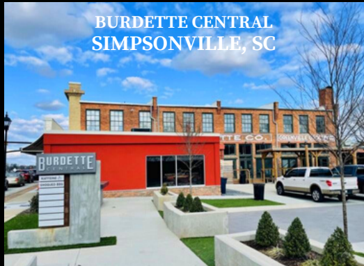
BURDETTE CENTRAL SIMPSONVILLE, SC