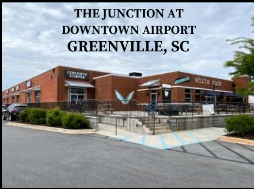
THE JUNCTION AT DOWNTOWN AIRPORT GREENVILLE, SC