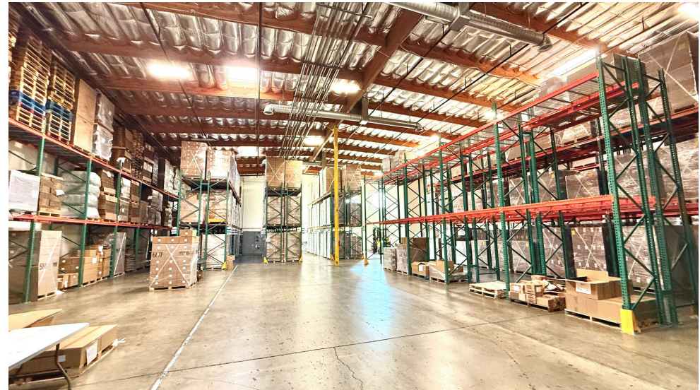
WAREHOUSE 24' CEILING HEIGHT