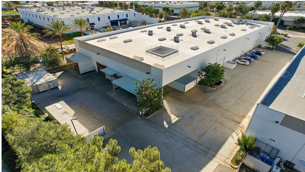
YARD - BACK & SIDE OF BUILDING