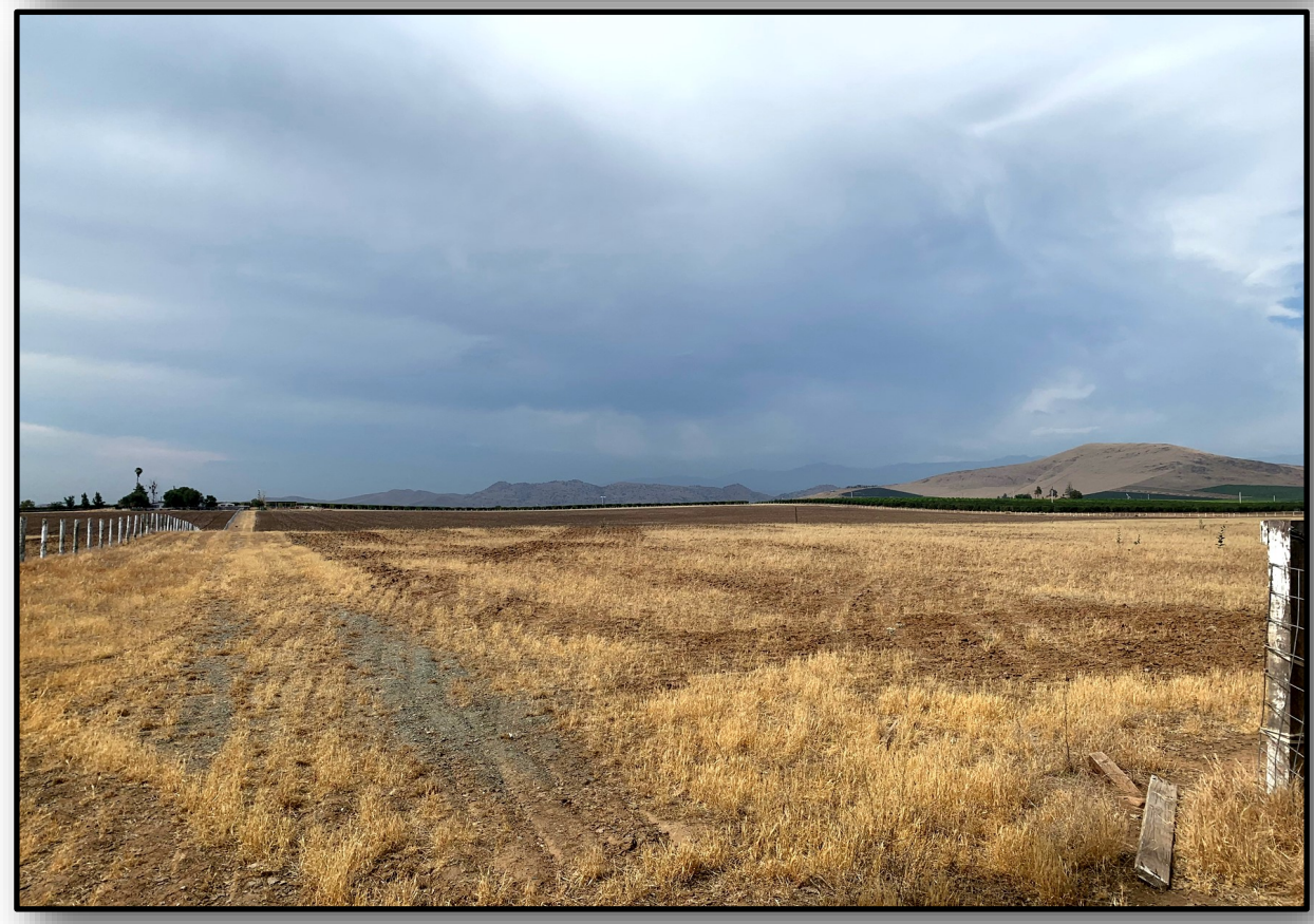
This statement is based upon information which we believe to be correct and is obtained from sources which we regard as reliable, but we assume no liability for errors or omissions.