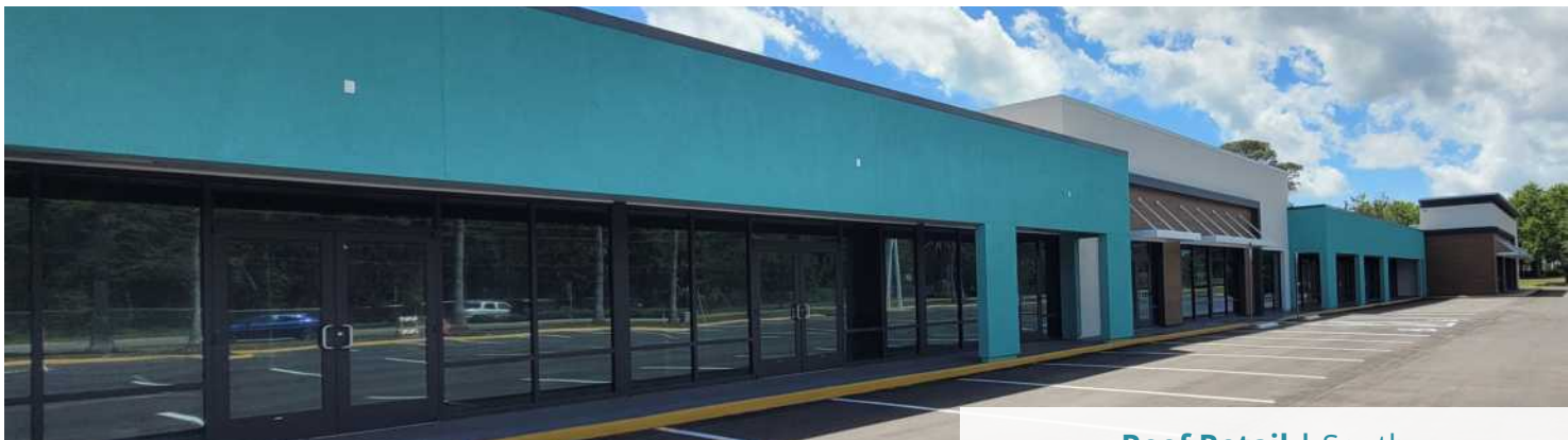
Reef Retail | South