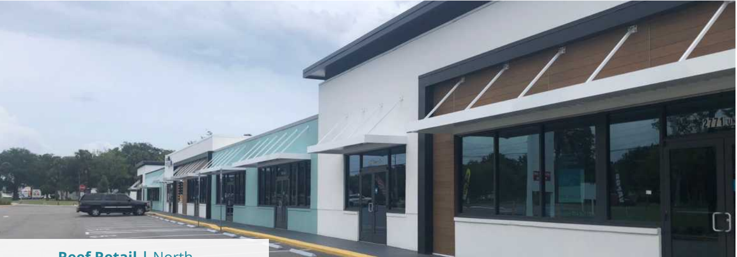
Reef Retail | North