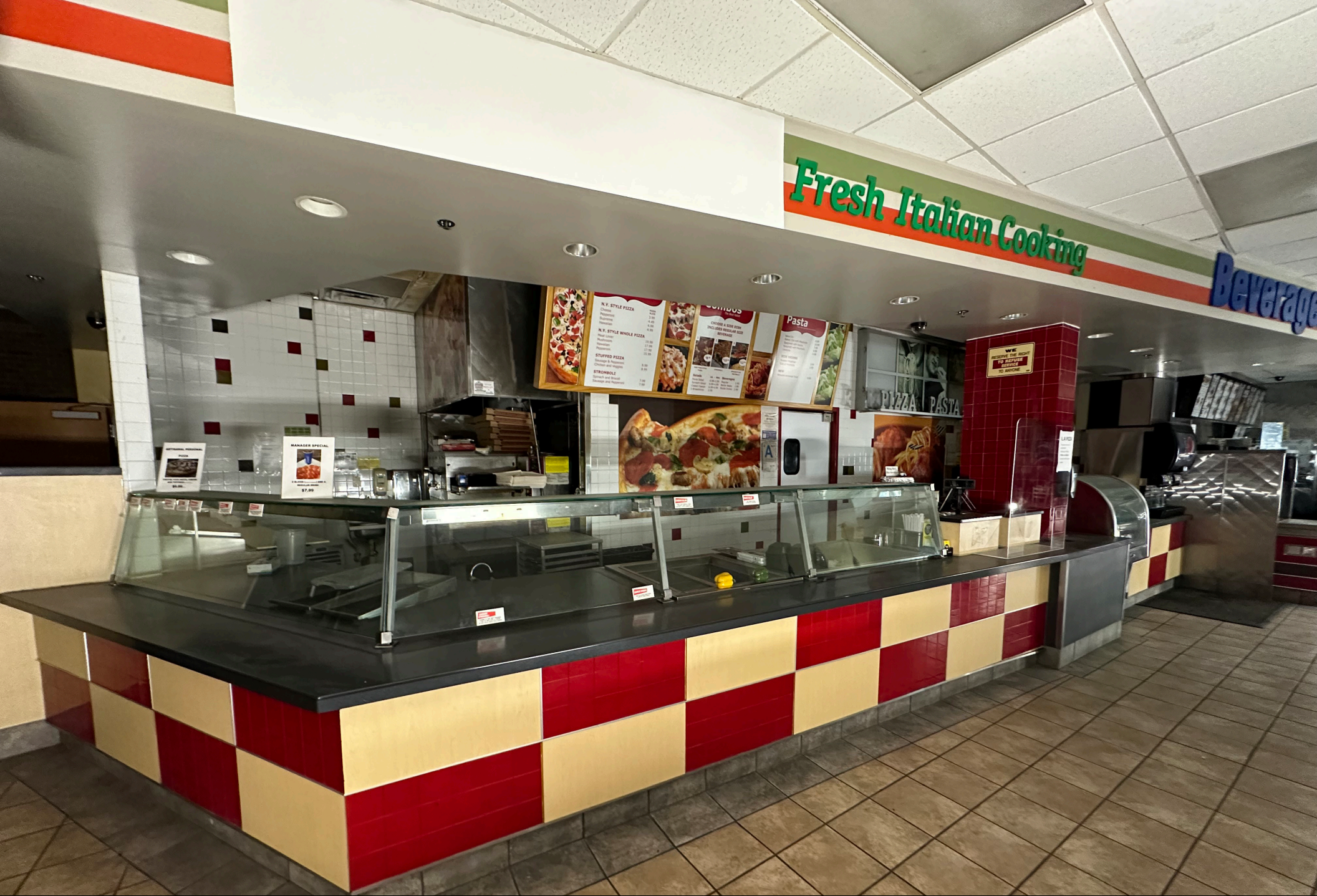
8,000 SF of 2nd Generation Restaurant Space Across the Street from the Iconic Grand Central Market