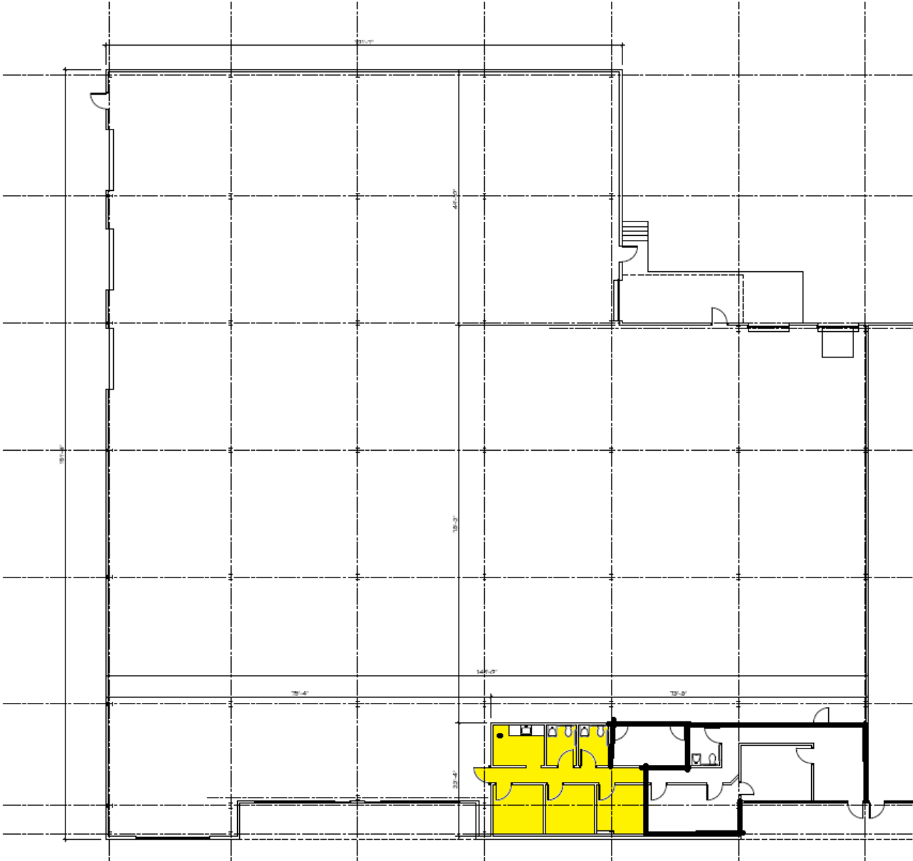
EXISTING CONDITIONS FIRST FLOOR PLAN SCALE: 1/8" = 1'-0"