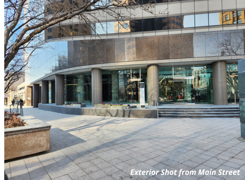
Exterior Shot from Main Street