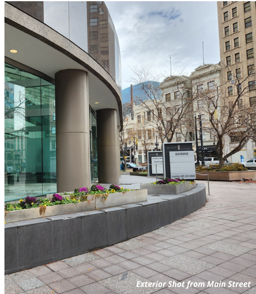
Exterior Shot from Main Street