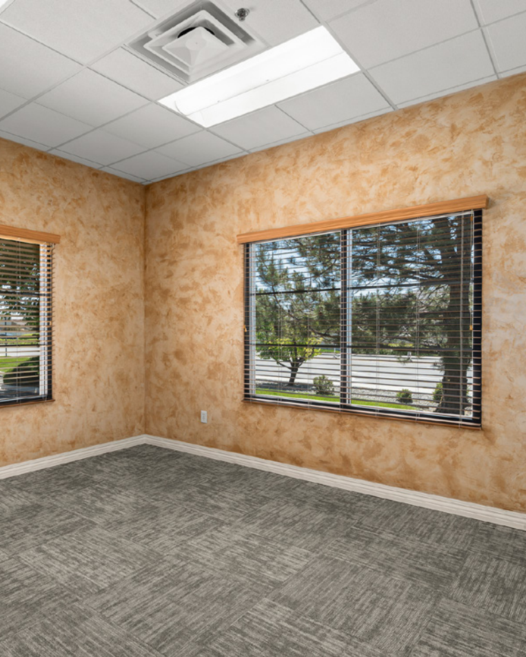
SUITE 103 ◀ Photos