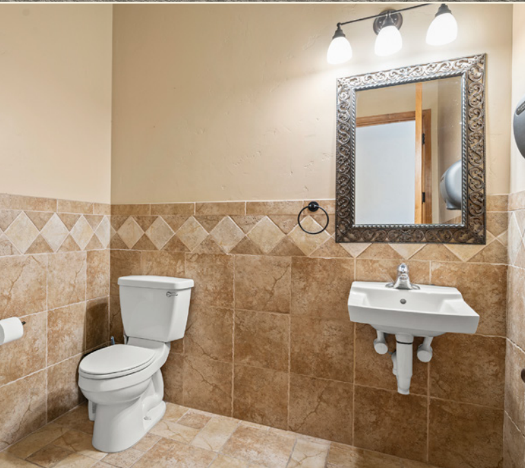
SUITE 204 Photos ▶