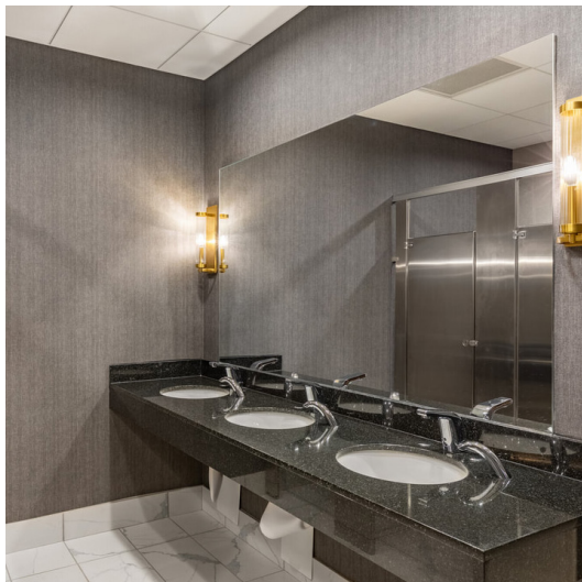
RE-IMAGINED COMMON AREAS & RESTROOMS