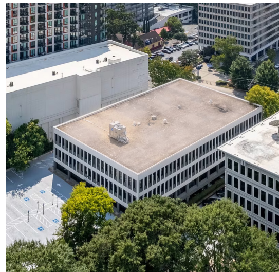
ALL NEW HVAC