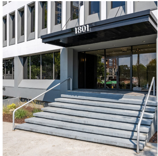
BRAND NEW EXTERIORS, LANDSCAPING, & MONUMENT SIGN