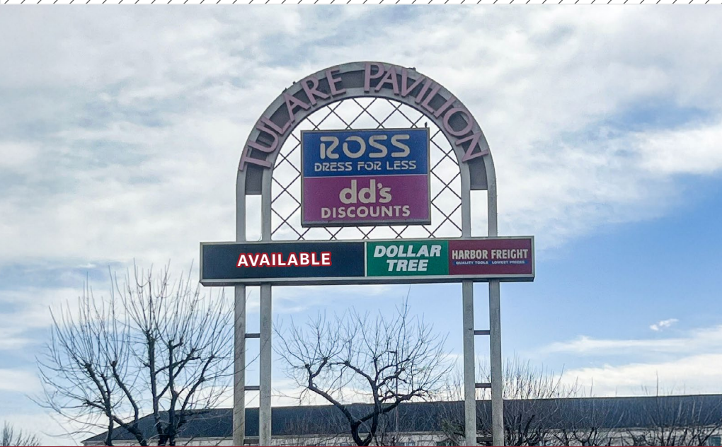
FREEWAY 99 PYLON SIGN AVAILABLE