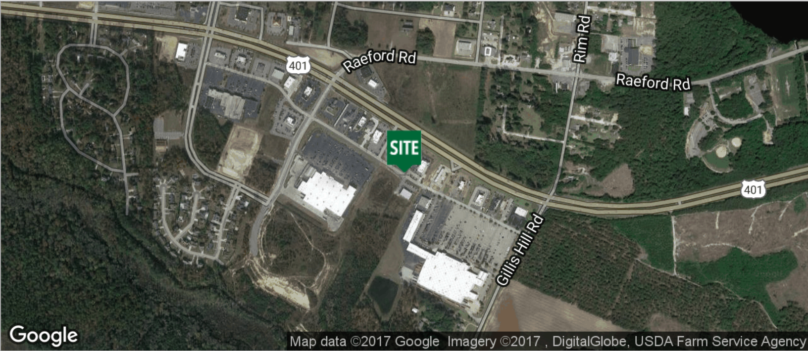
Map data ©2017 Google Imagery ©2017 , DigitalGlobe, USDA Farm Service Agency