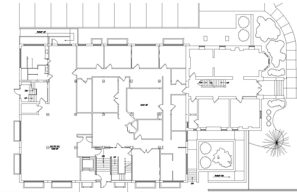
2 FIRST FLOOR PLAN A1.1 SCALE: 1/8" = 1'-0"