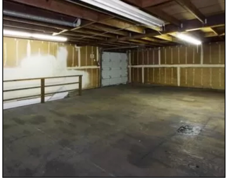
Mezzanine Storage Area