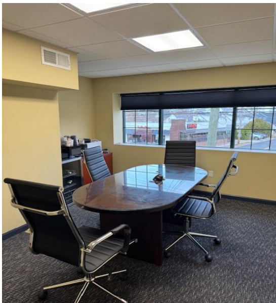
2 nd Floor Office/Conference Room

For information and/or inspection call Exclusive Agent: