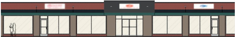
PRELIMINARY EAST MAIN STREET ELEVATION (NORTH)