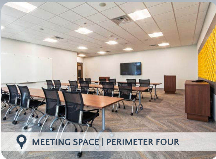
📍 MEETING SPACE | PERIMETER FOUR