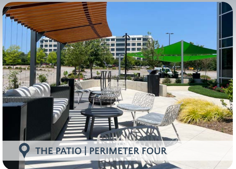
📍 THE PATIO | PERIMETER FOUR