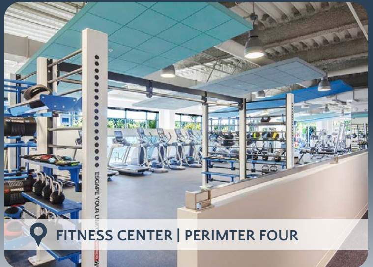
📍 FITNESS CENTER | PERIMETER FOUR