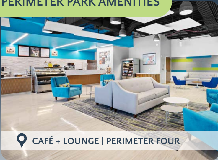
📍 CAFÉ + LOUNGE | PERIMETER FOUR