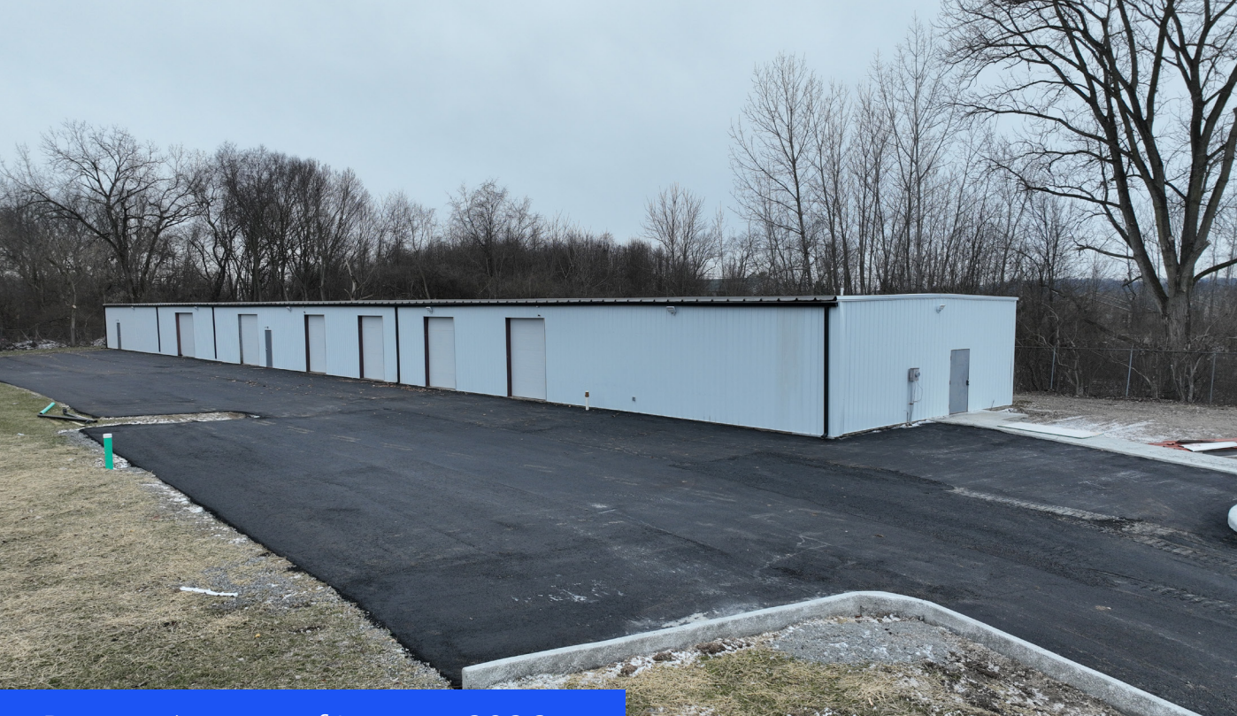
Renovations as of January 2026