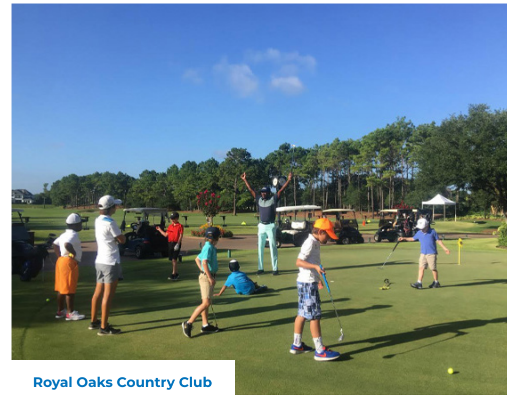
Royal Oaks Country Club