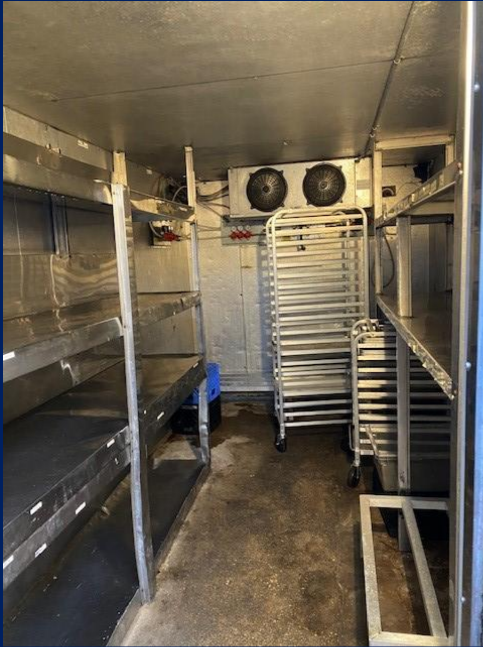
Interior of Walk In Cooler/Freezer