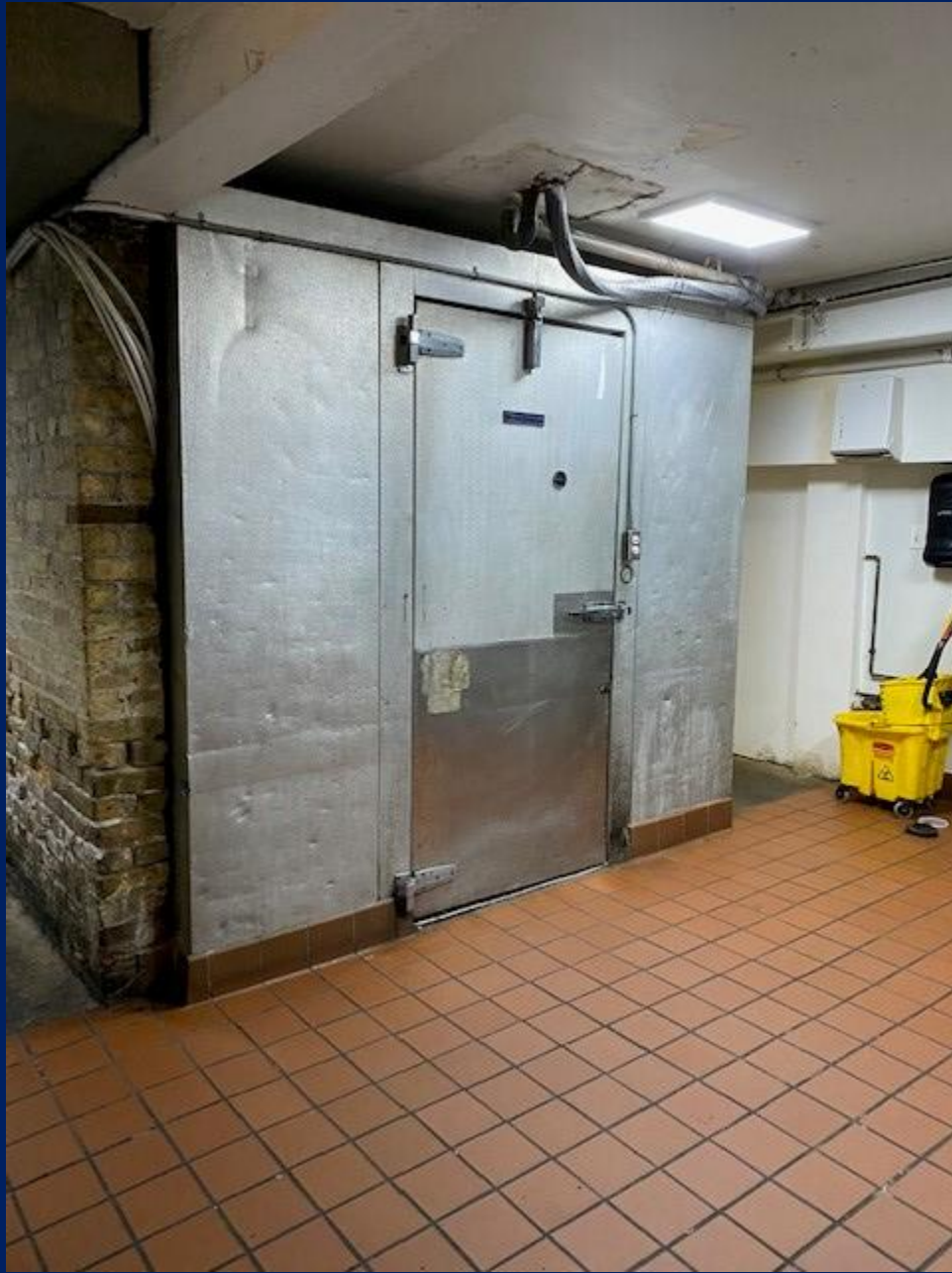
Walk In Cooler/Freezer