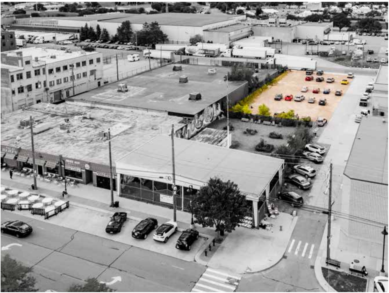
[CLOCKWISE FROM ABOVE] GRATIOT AVE VIEW, PROPERTY ELEVATION, AND PARCEL OUTLINE SHOWING INCLUDED PARKING