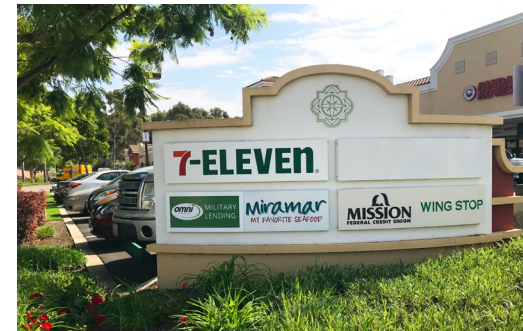
Lighted Corner Monument Sign