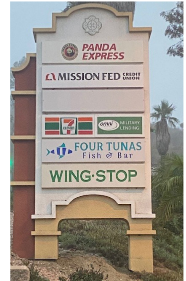
Lighted Pylon Sign

Premium corner suite available along 76 HWY with pylon and monument signage, and dual facade signage on south and east storefronts!