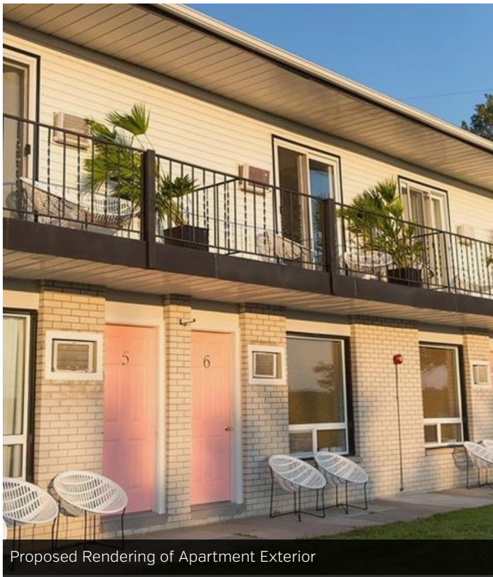
Proposed Rendering of Apartment Exterior