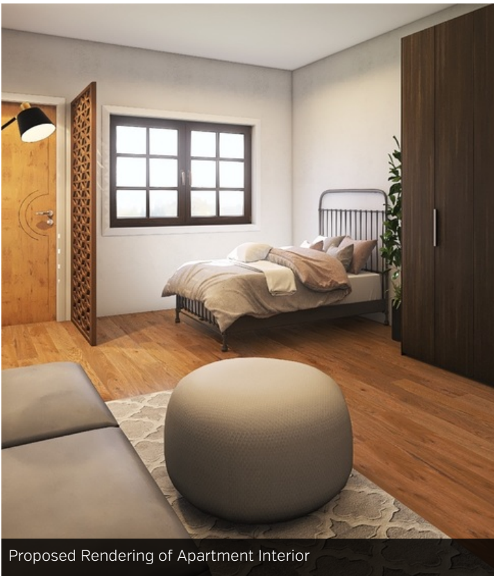
Proposed Rendering of Apartment Interior