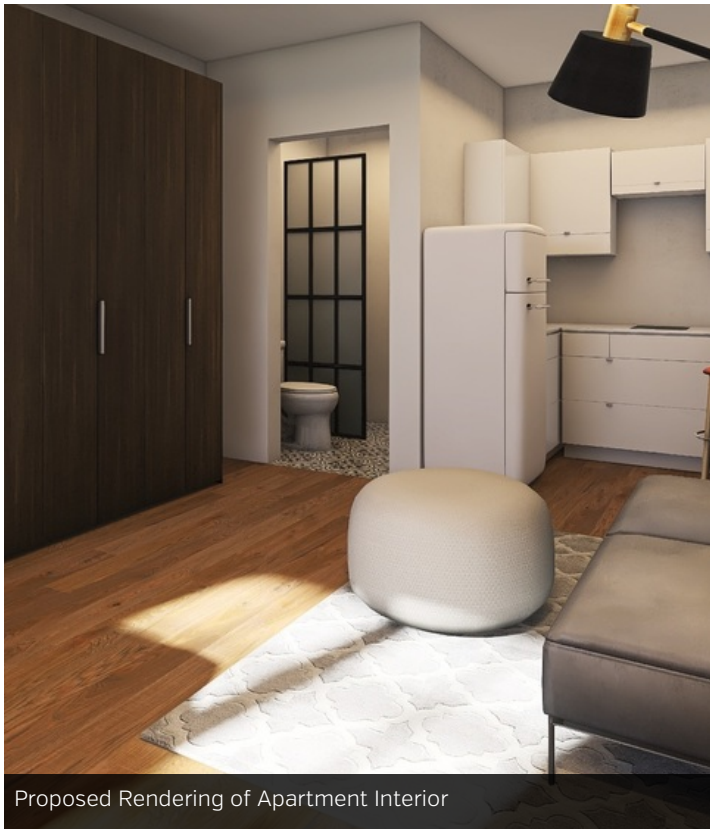
Proposed Rendering of Apartment Interior