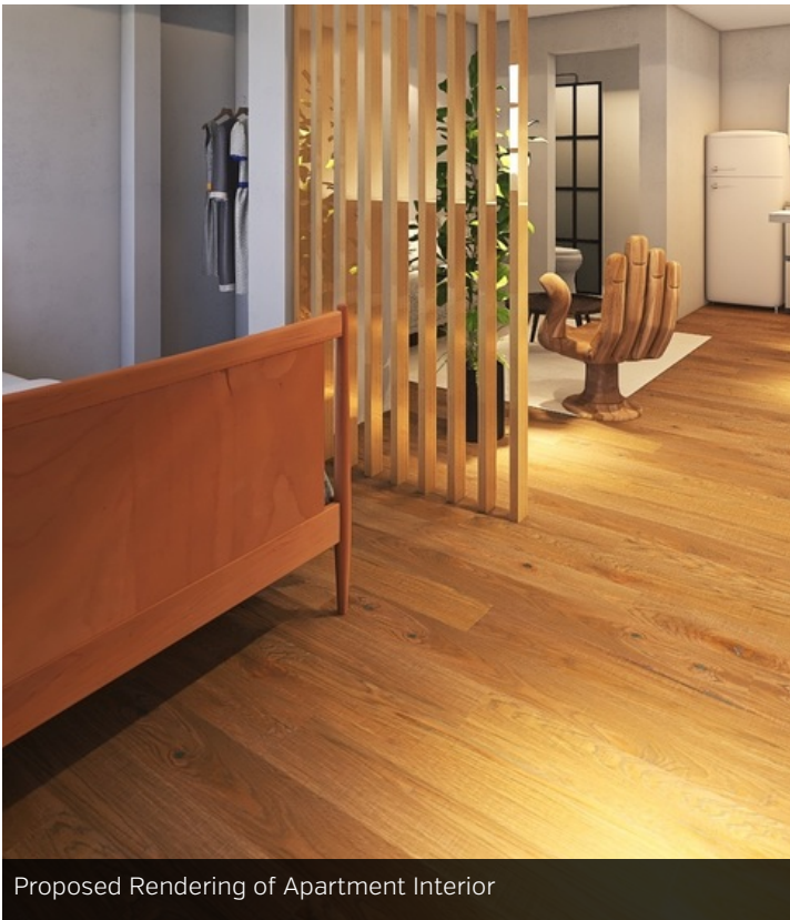
Proposed Rendering of Apartment Interior

TAYLOR GIBBONS C: 509.939.1741 taylor.gibbons@svn.com