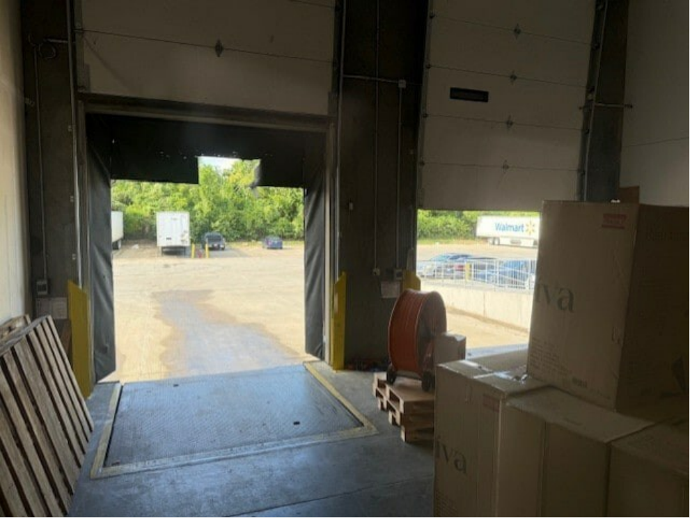
Inside Dock Doors