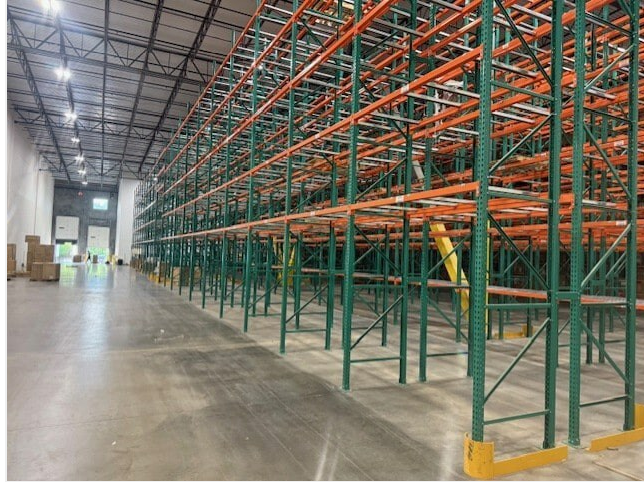
Back of Warehouse