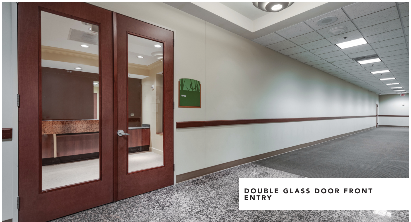
DOUBLE GLASS DOOR FRONT ENTRY