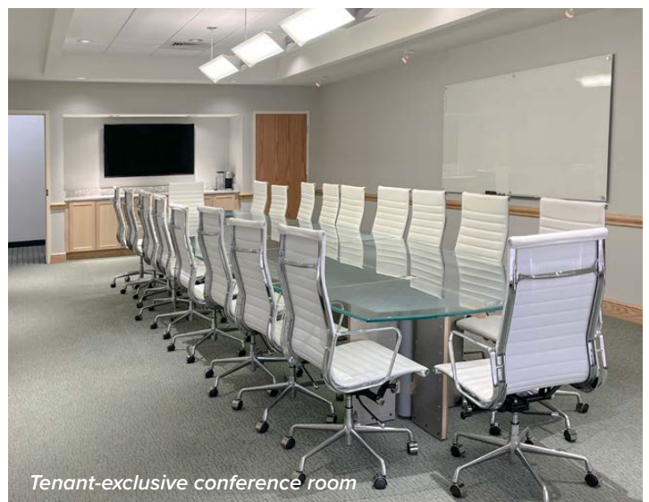
Tenant-exclusive conference room