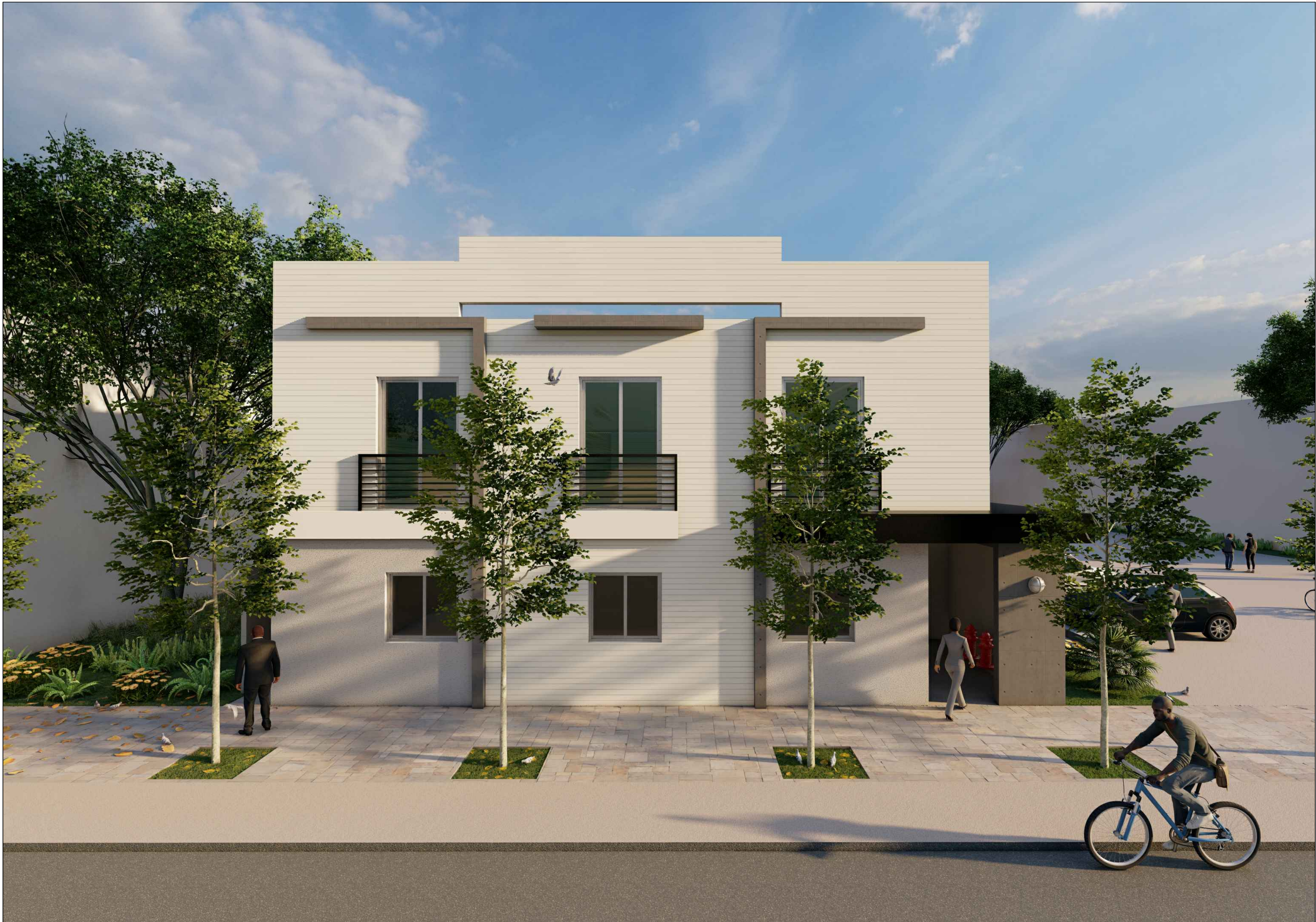
NEW MULTIFAMILY BUILDING (14 UNITS) 1567 NW 1ST STREET MIAMI, FL 33125 OWNER: URBANA1567, LLC