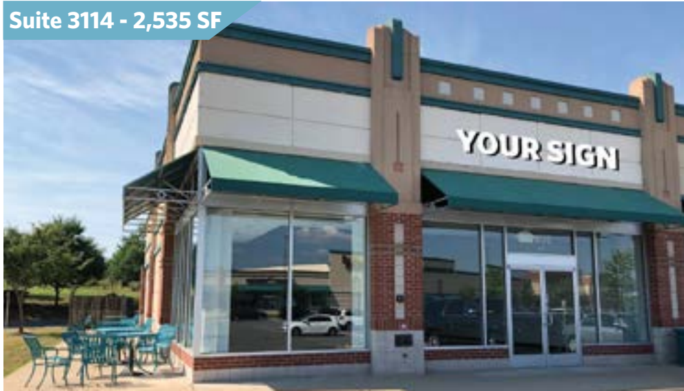
Suite 3114 - 2,535 SF