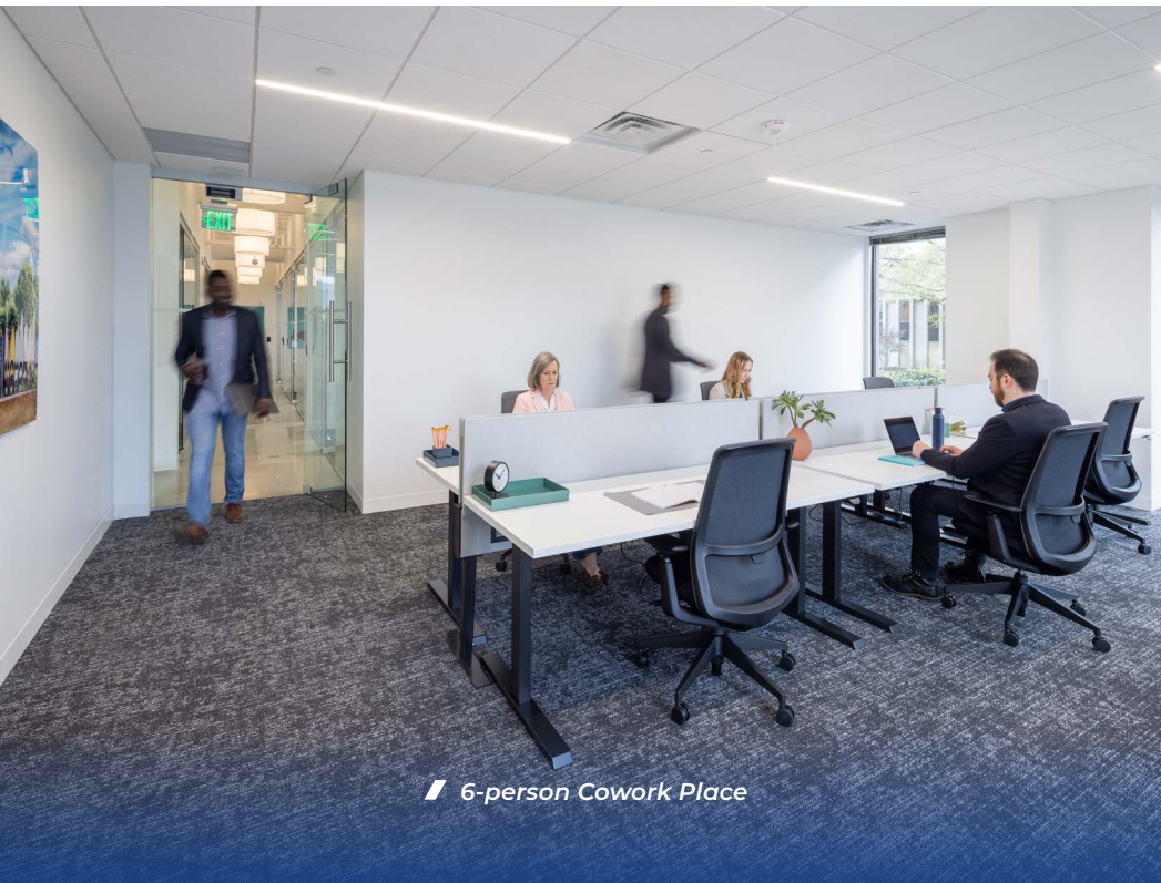
6-person Cowork Place