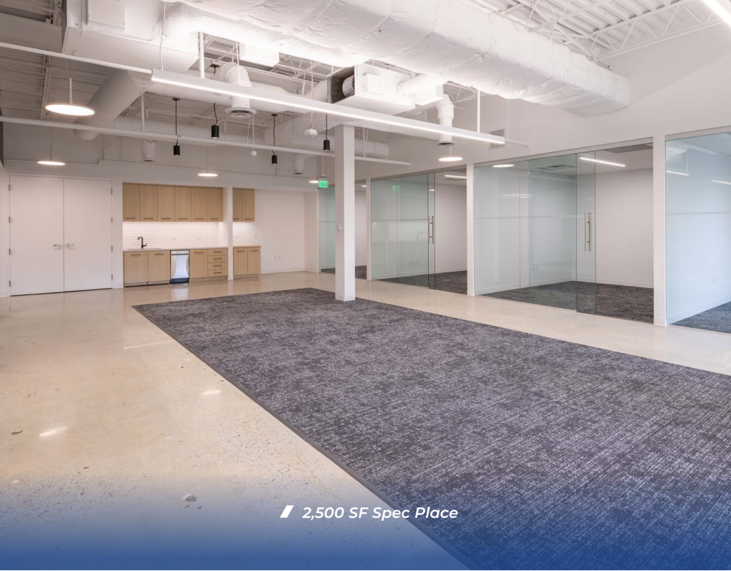
2,500 SF Spec Place