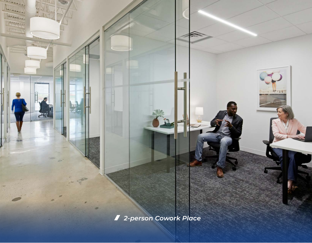
2-person Cowork Place