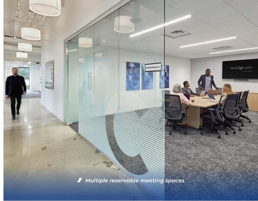
Multiple reservable meeting spaces