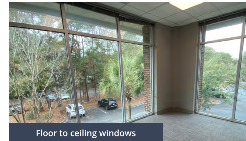
Floor to ceiling windows