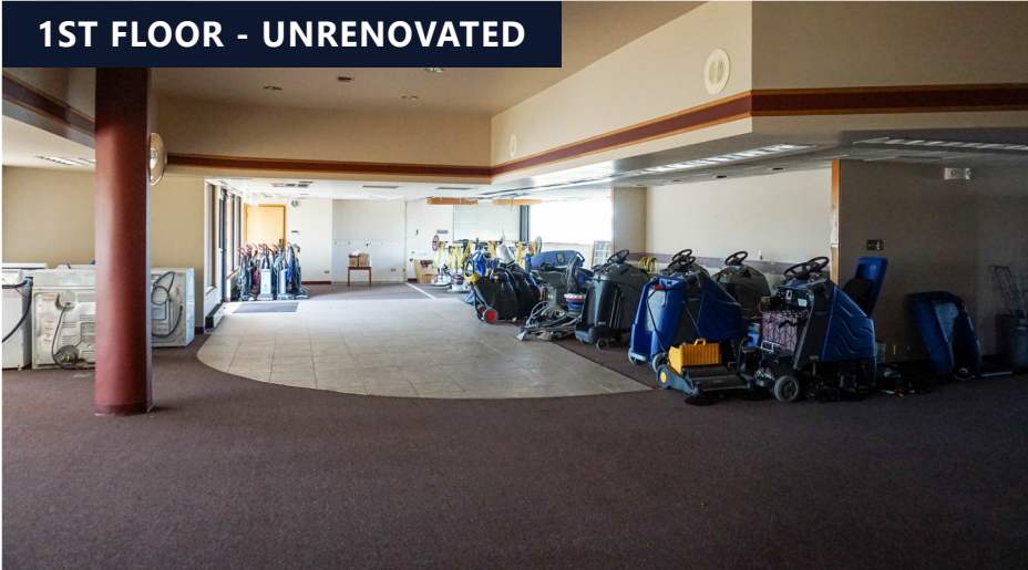
1ST FLOOR - UNRENOVATED