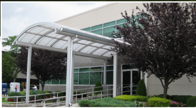
• PARK ATRIUM •