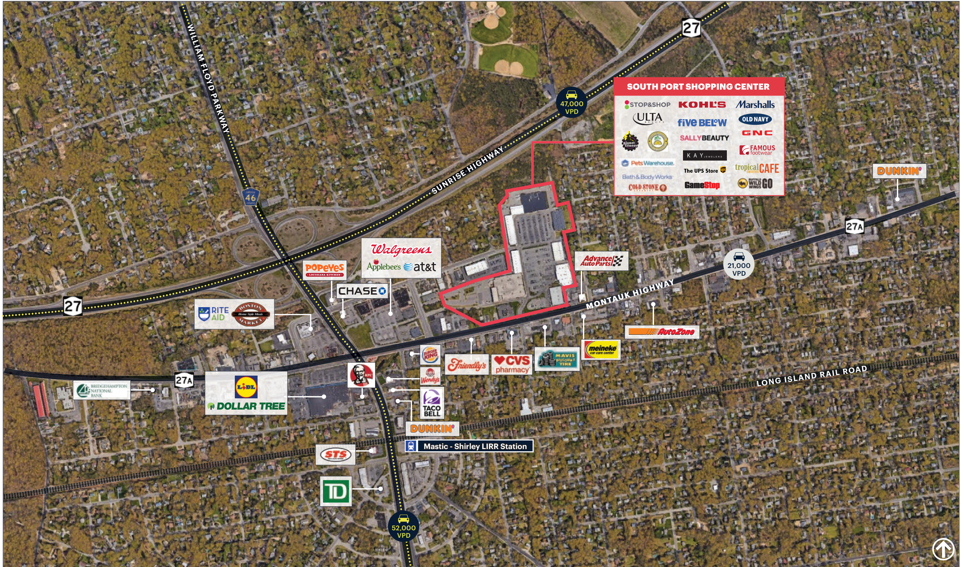
SOUTH PORT SHOPPING CENTER SHIRLEY, NEW YORK