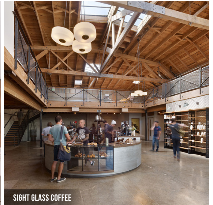
SIGHT GLASS COFFEE