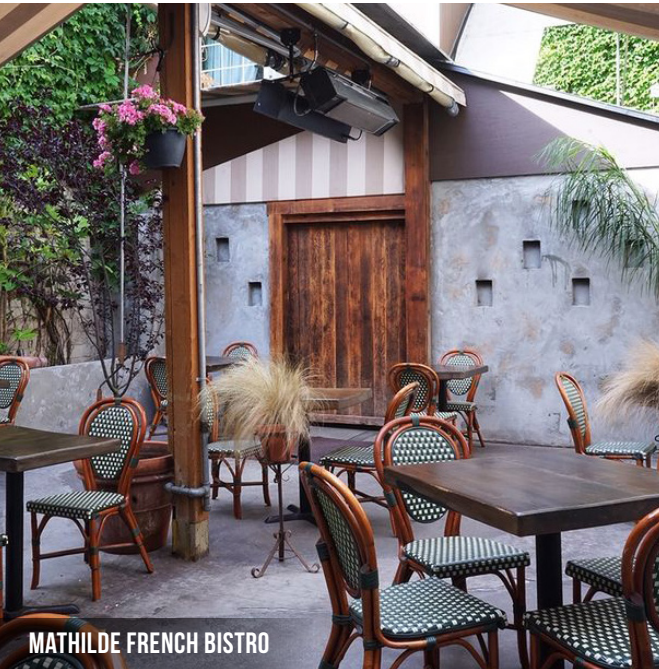
MATHILDE FRENCH BISTRO