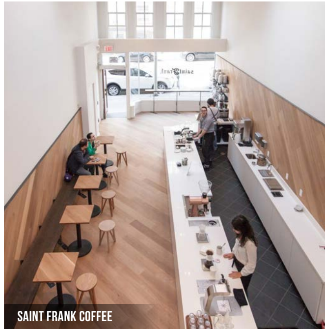
SAINT FRANK COFFEE