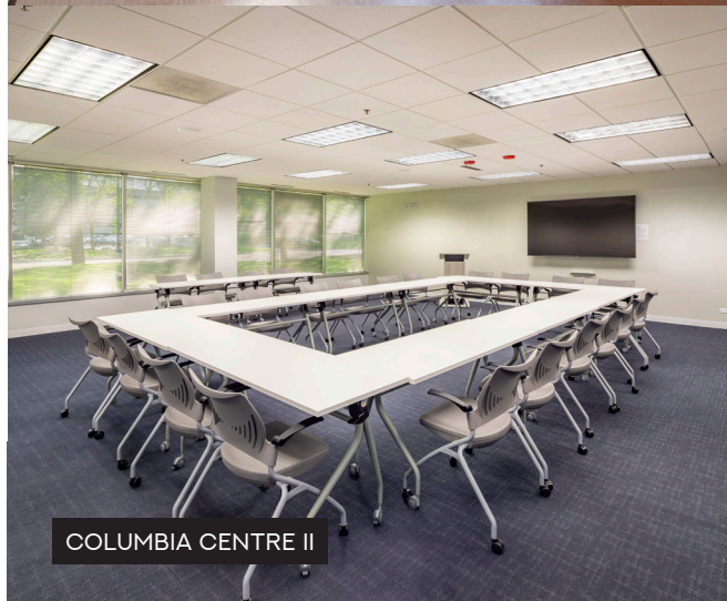
COLUMBIA CENTRE II