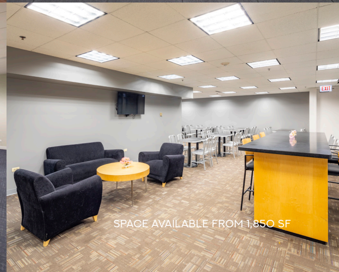
SPACE AVAILABLE FROM 1,850 SF