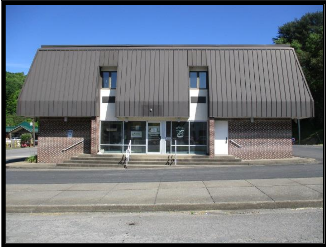
View from Market Street

The first phase of the building was completed in 1986 (first floor). The second phase of the building was completed in 2010 (second floor). The building was most recently used as First Exchange Bank's Headquarters until the bank's headquarters was moved to its new White Hall Banking location in 2019. The property is zoned "Downtown Commercial".