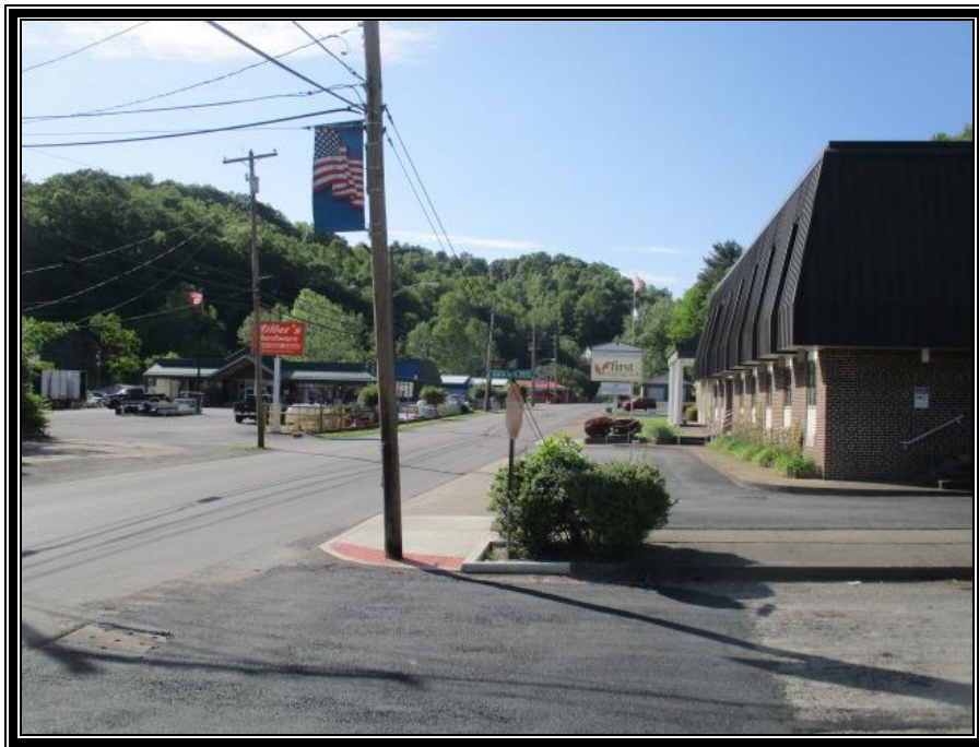
U S ROUTE 250 LOOKING NORTHWEST, PROFESSIONAL BUILDING ON RIGHT