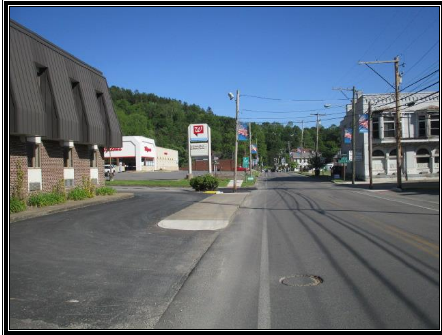
U S ROUTE 250 LOOKING SOUTHEAST, PROFESSIONAL BUILDING ON LEFT