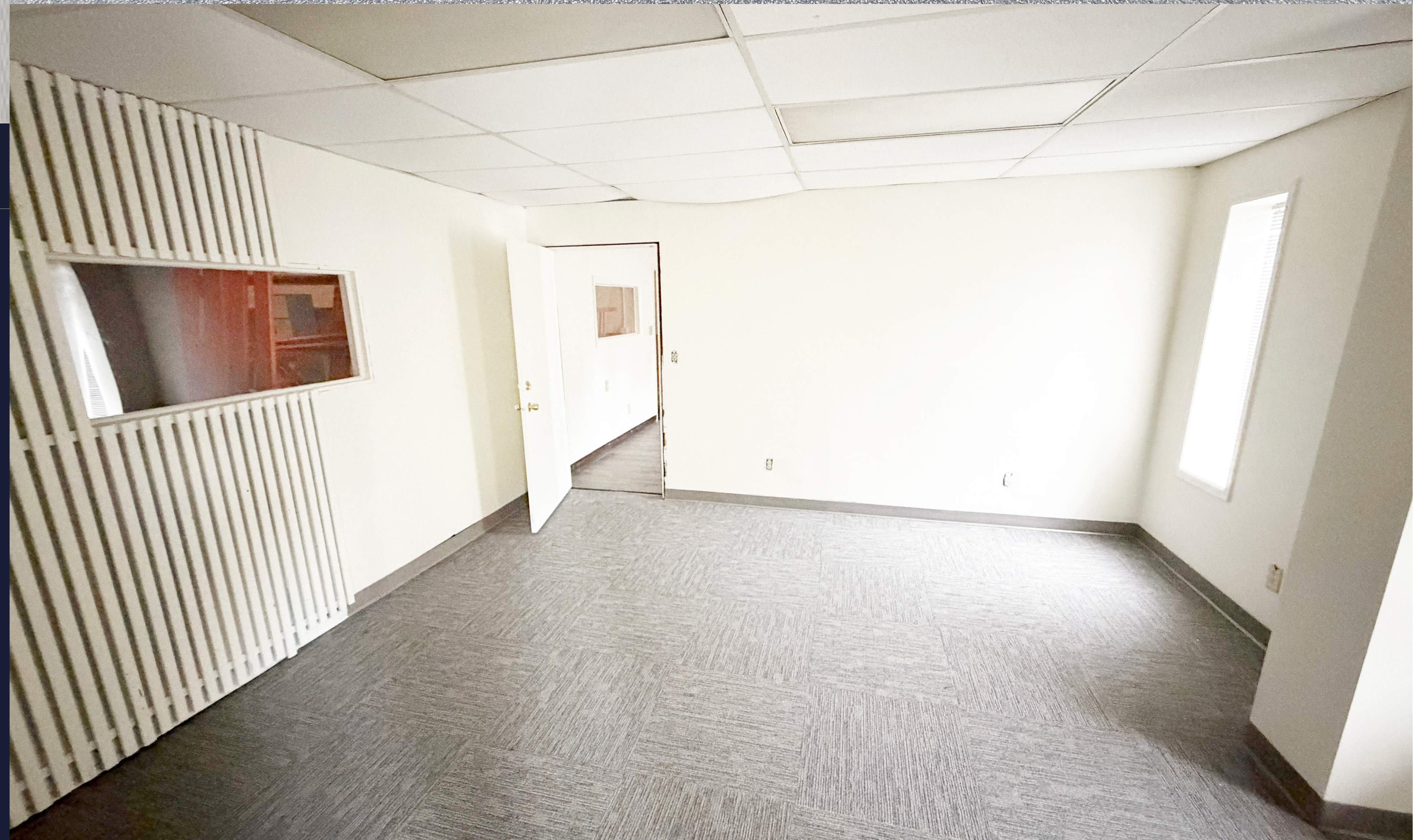
Industrial/Flex Buildings For Lease