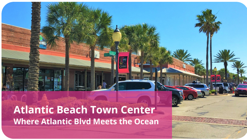
Atlantic Beach Town Center Where Atlantic Blvd Meets the Ocean