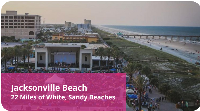
Jacksonville Beach 22 Miles of White, Sandy Beaches