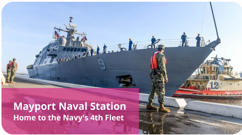
Mayport Naval Station Home to the Navy's 4th Fleet